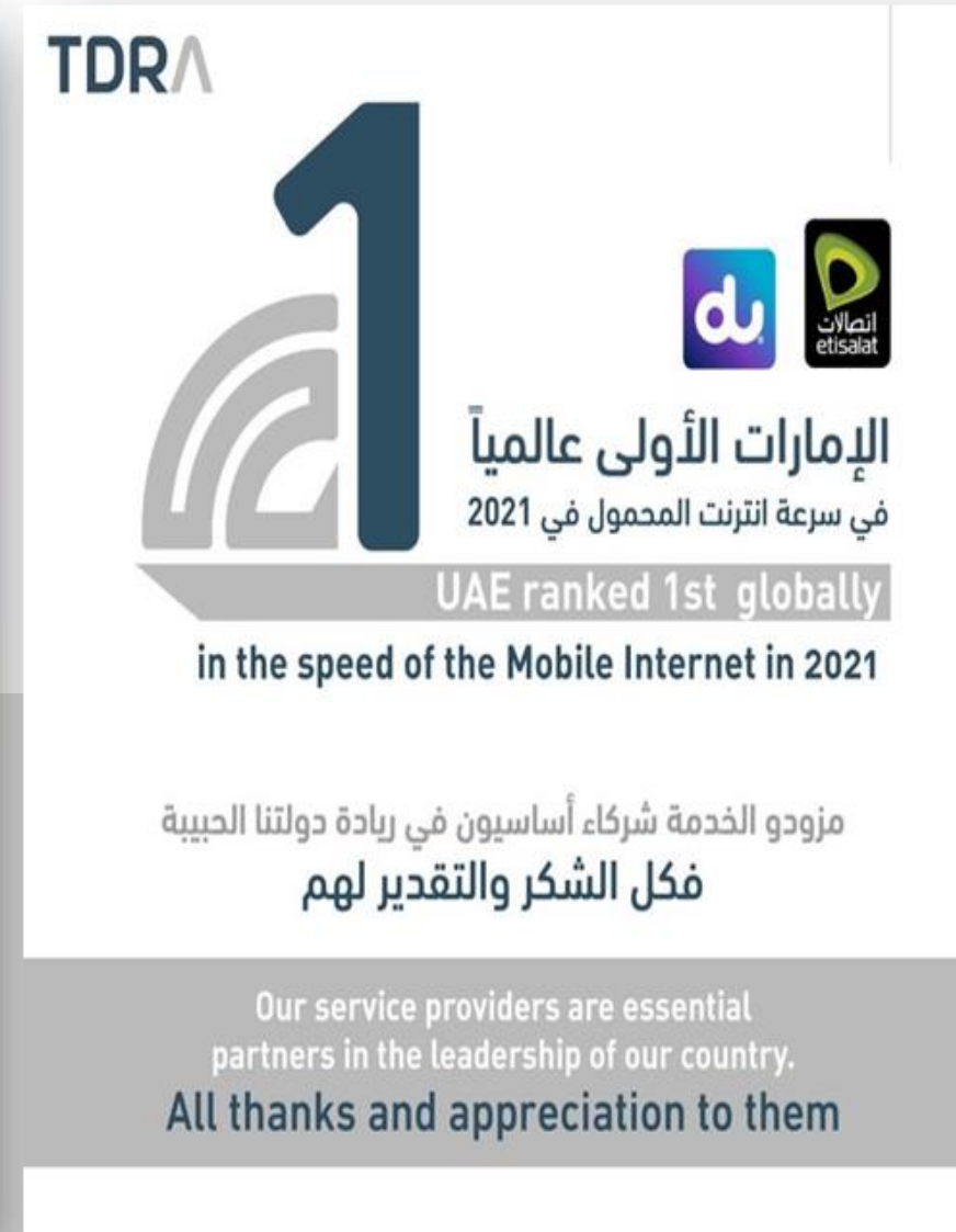
Speed of Mobile Internet