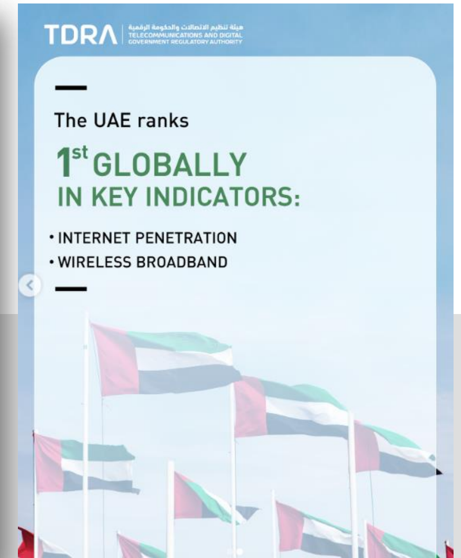
Mobile Broadband Internet Index