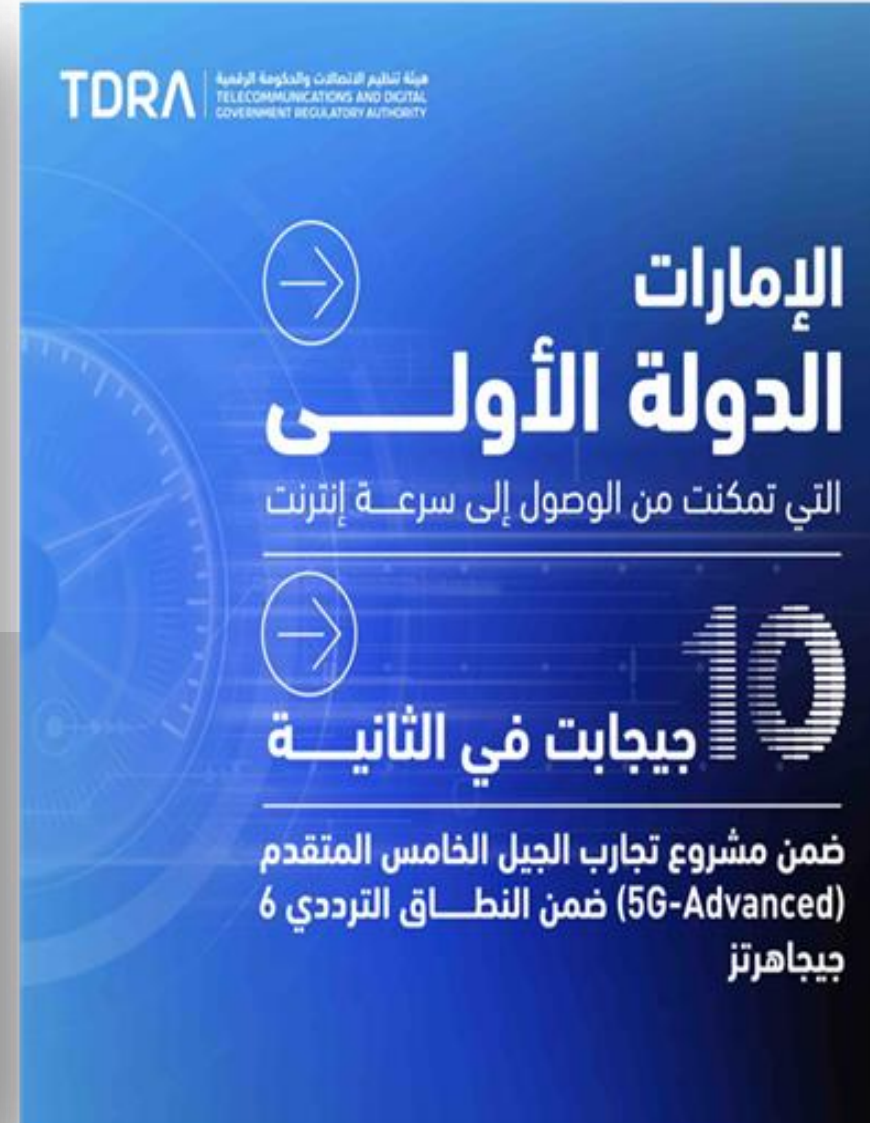
Internet speeds of 10 Gbps